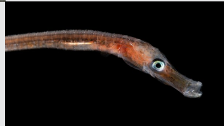
Image of the week: Small mouth, big aspirations Pipefish, like this slender larva, are close relatives of sea horses and sea dragons

WHOI partners with Pangaea Logistics Solutions to deploy more ocean data-collecting tools abroad