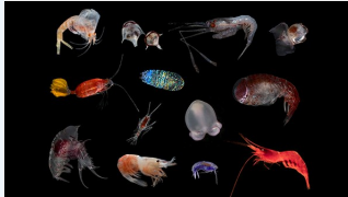
Image: Most of creatures in the Ocean Twilight Zone are spineless. Invertebrates, like zooplankton and jellies, make a massive contribution to life on our planet as a key link in the food chain and by helping move carbon and other nutrients throughout our oceans.