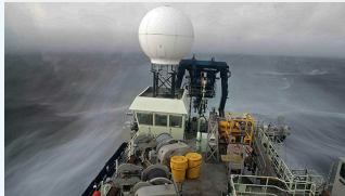
Image: Oceanographers on this North Atlantic expedition on R/V Atlantis got more than their share of rough seas, skirting Hurricane Igor, a tropical storm and a nor'easter. Despite this, the ship and its crew enabled the science team to complete most of their research.