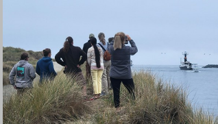
Image of the week: Fair thee well, old friend! Last week, former WHOI research vessel Oceanus sailed toward retirement after leaving Newport, OR

The perfect vest to wear for leaf-peeping! Get your WHOI fleece vest on the ShopWHOI site today! All proceeds support ocean science