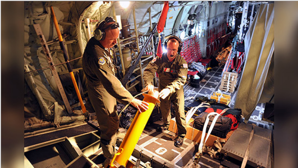
New Air-Launched Devices Help Study Hurricanes See what oceanography in flight looks like.