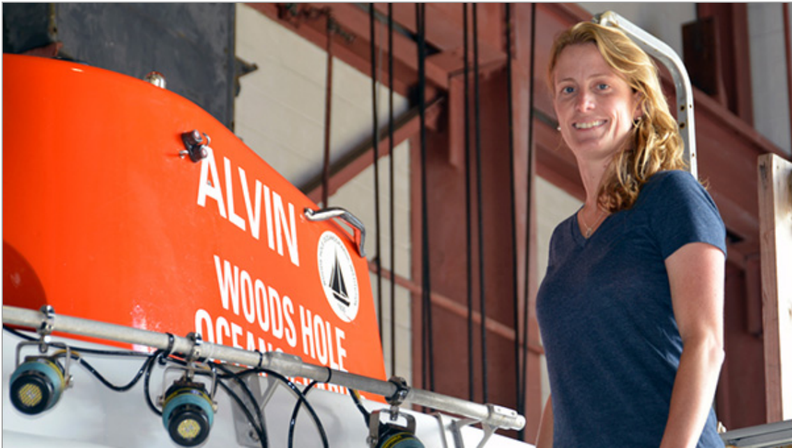
NASA Names WHOI Engineer to Astronaut Program