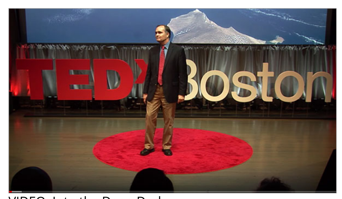
VIDEO: Into the Deep Dark A TedxBoston talk by a WHOI pioneer in the development of autonomous marine robots.