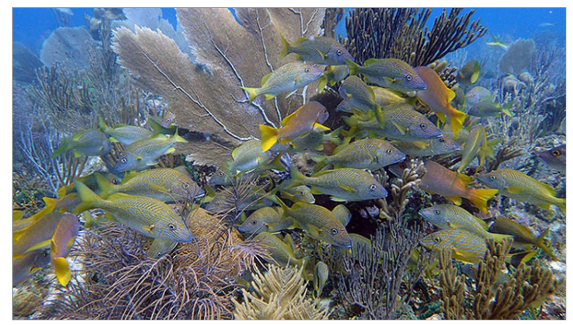
In the Gardens of the Queen An international study of one of the Caribbean's last pristine reefs