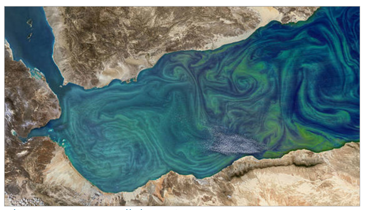
Climate Science Collaboration

An all-star team joins forces to solve a carbon cycle riddle