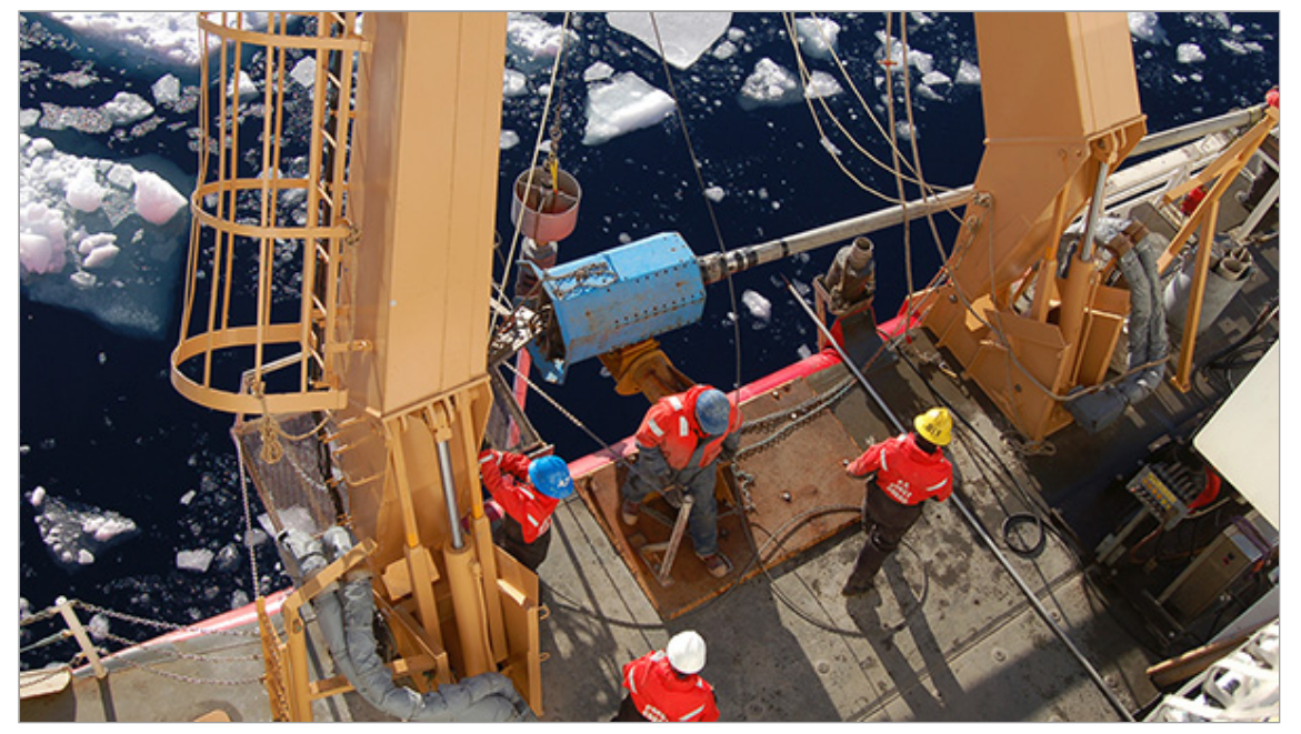
Following the Fresh Water

WHOI researchers uncover the catalyst of an ancient cold snap