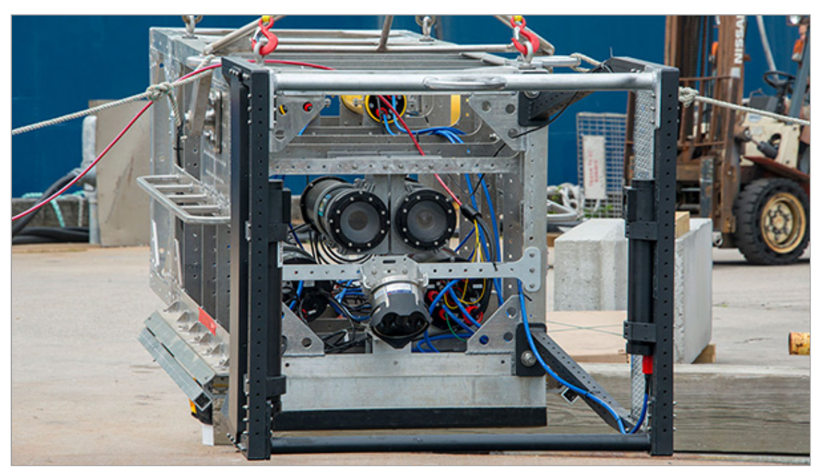
A Journey to the Ocean's Twilight Zone Begins

A remarkable instrument extends our senses into the depths