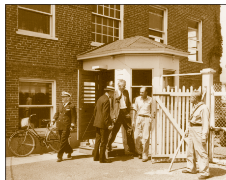
The Institution grew substantially during World War II as host to many Navy projects.