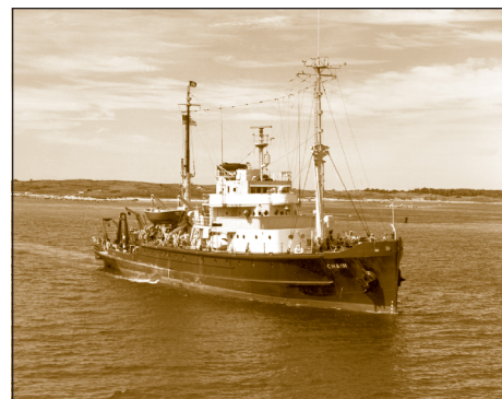
The arrival in 1958 of the research vessel Chain, a converted Navy salvage tug, signaled a move to big-ship oceanography.