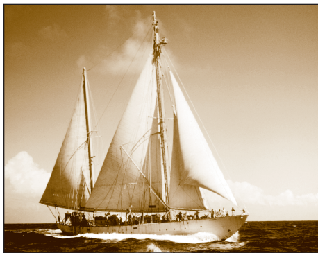
Bigelow applied knowledge gained on many research voyages in the Gulf of Maine to design of the first blue-water research vessel, the 142-foot steel-hulled ketch Atlantis.