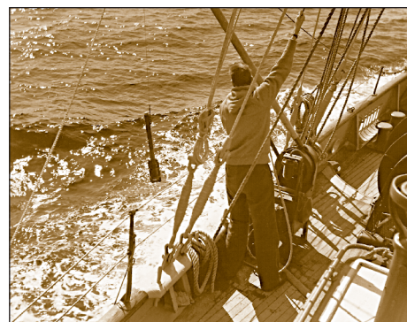
Data from bathythermograph, an important early instrument designed at WHOI, helped save US submarines during the war.