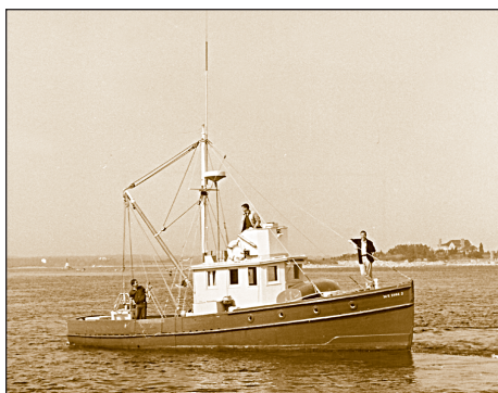
The 40-foot collecting vessel Asterias, named for a local starfish, completed the first fleet.

south of Cape Cod, a small but deep water harbor suitable for berthing oceanographic vessels, and proximity to several universities.