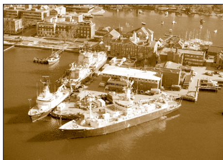
WHOI scientists range the world ocean from their laboratories based in the village of Woods Hole, pictured here in a rare moment with three ships in port, and on the nearby Quissett Campus.

grams Office administers a variety of additional academic activities.