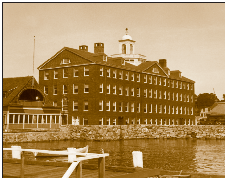
The Institution's first building, a four-story brick structure, was later named for Henry Bigelow.