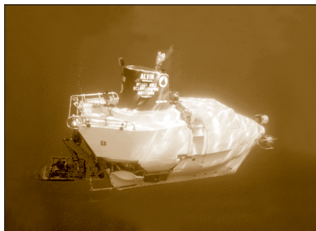
Today the US National Deep Submergence Facility operated by WHOI includes the submersible Alvin, pictured, along with robotic and towed vehicles.