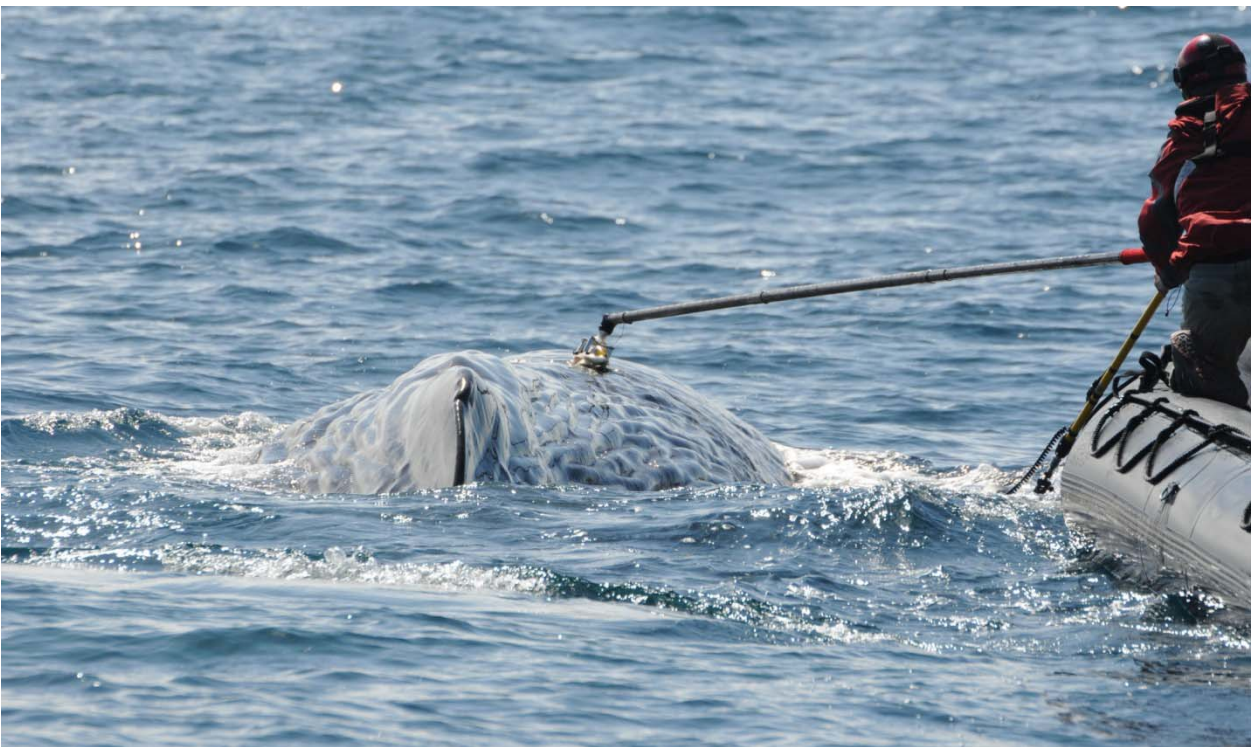
Attaching a tag to a sperm whale in New Zealand