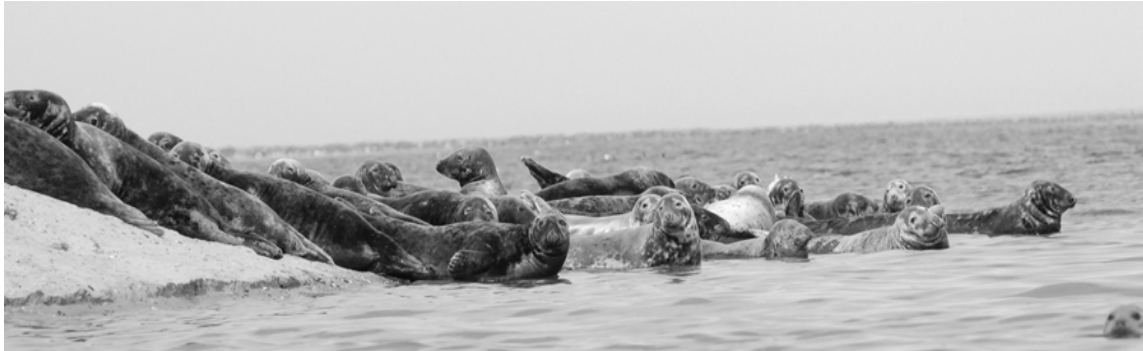
Grey seals are hauling out in increasing numbers on sandbars on Outer Cape Cod