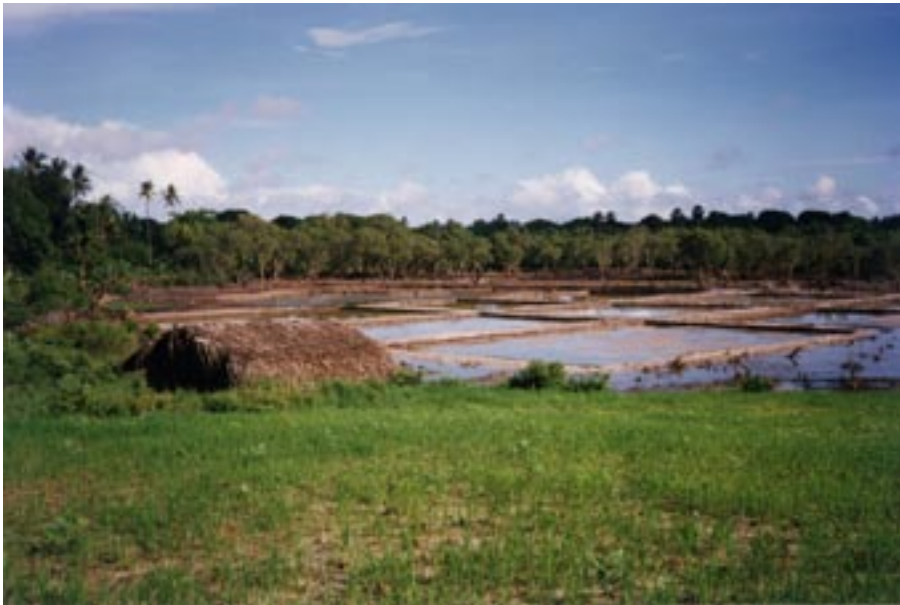
Hauke Kite-Powell, WHOI