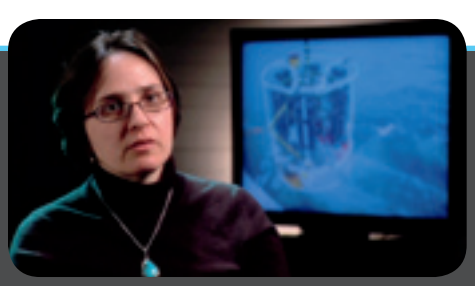
// SEE THE VIDEO @ www.whoi.edu/deepwaterhorizon/chapter6