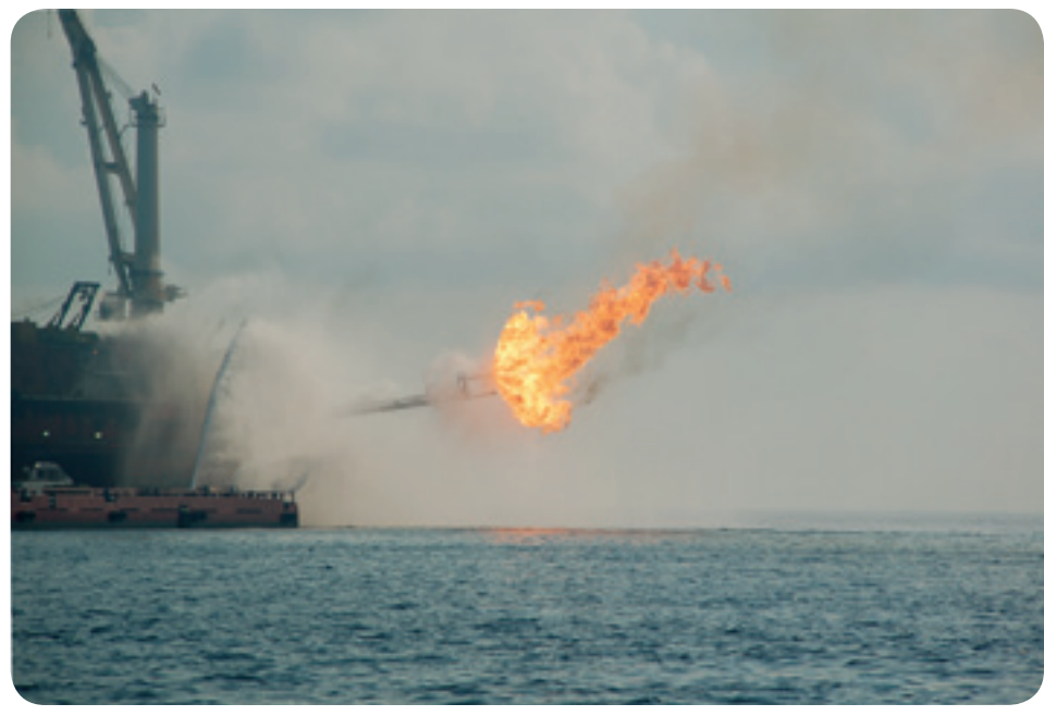
"We were in the middle of something apocalyptic," said one scientist. "The ship was between two others that were burning off natural gas from the blowout. You had these two flames coming out like the nose of a dragon."

WHOI, is called the Isobaric Gas-Tight sampler, or IGT. It could capture the critical sample and maintain its composition as it was brought up from the high pressure of the deep sea (see Page 8).