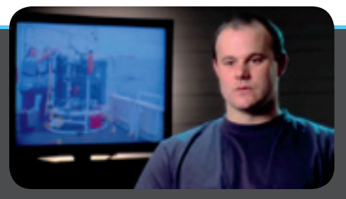
// SEE THE VIDEO @ www.whoi.edu/deepwaterhorizon/chapter3

Finally, the IGTs were ready for the ROV. But Oceaneering's ROV was not