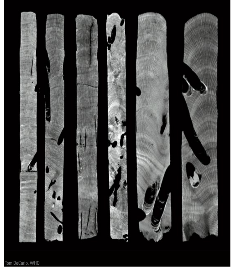
CT scan images have a resolution of about the width of a human hair. These images show the borings made by bioeroders in the coral skeleton.

So how do you drown a reef? The answer is "add acid." And to do it much faster, add nutrients. Both are happening now on many of our coral reefs.