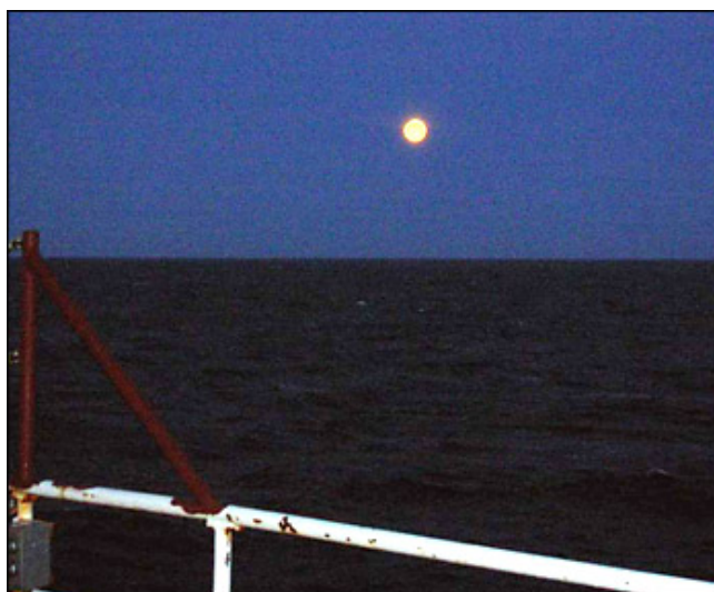
Moon rising off of the starboard side of Louis .

Copyright ©2007 Woods Hole Oceanographic Institution, All Rights Reserved. Mail: Woods Hole Oceanographic Institution, 266 Woods Hole Road, Woods Hole, MA 02543, USA. E-Contact: info@whoi.edu ; press relations: media@whoi.edu , tel. (508) 457-2000 Problems or questions about the site, please contact webdev@whoi.edu