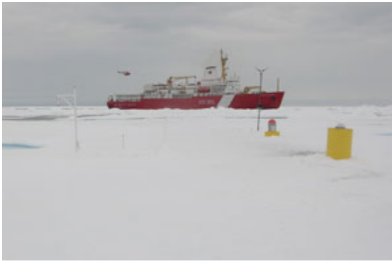
The three buoys finally installed: ice mass balance buoy, barely visible in white on the left, the wind generator and the yellow and red float of the ocean flux buoy in the center, and the ITP on the right. Time to go back!