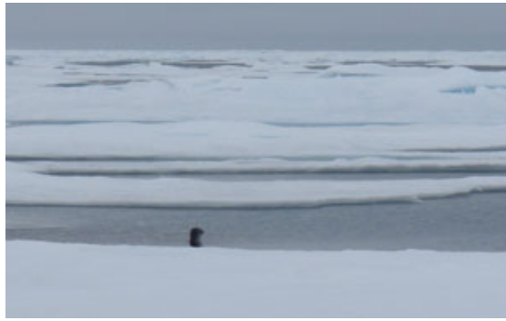
Just as we were leaving, a seal came by to try to figure out where these cables and sticks hanging from the bottom of his favorite ice floe came from..