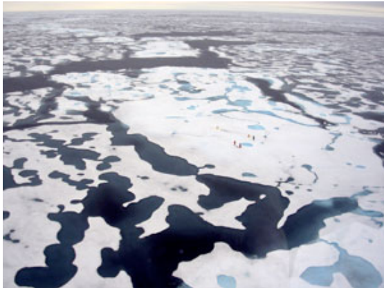
Camp Zebra, after we were all done. I know, I don't see the zebra either... (Photo by Rick Krishfield).