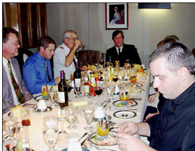
Sunday supper at the Captain's Table.