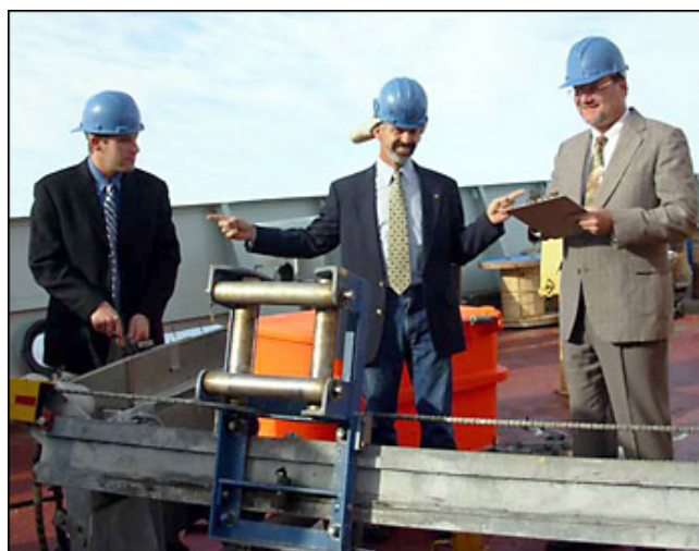
After supper, it's back to work on the foredeck for the WHOI mooring guys.

Copyright ©2007 Woods Hole Oceanographic Institution, All Rights Reserved.