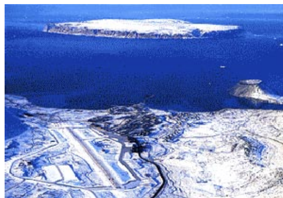
Thule Air Base.

Problems or questions about the site, please contact webdev@whoi.edu