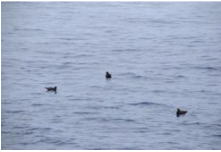
Shrinking Cups 12 and wait .... 😊