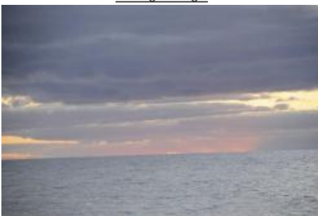
Shrinking Cups 17 The sun rises...