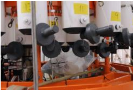
Shrinking Cups 15. In the middle - behind the bottles and CTD.