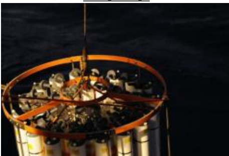
Shrinking Cups 16 This time the 2am to 2pm shift sends the rosette and cups down in the dark.