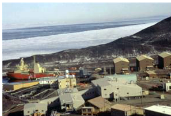
McMurdo Station, Antarctica.