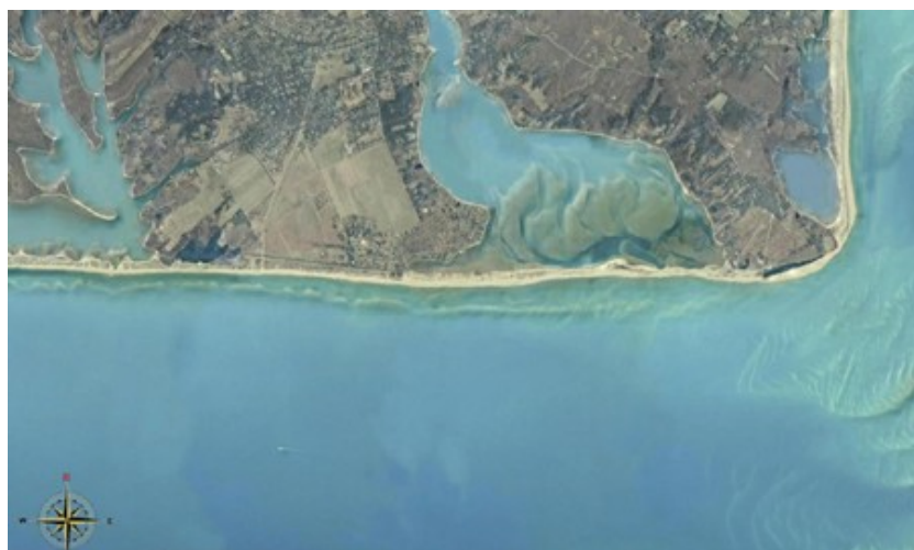
NASA World Wind/2003 MassGIS - 0.5m resolution