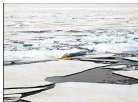
Secondary recovery floats, which are located at the bottom of the mooring, coming up between ice floes.