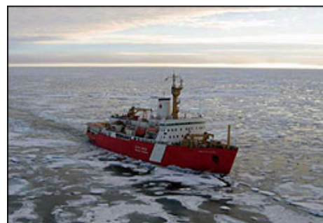
CCGS Louis S. St. Laurent.