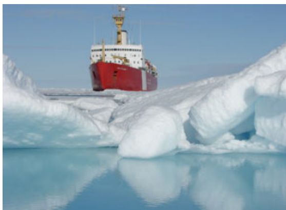
The CCGS Louis S. St-Laurent .

We stayed with the float all day and the following day (August 17), we successfully recovered ITP-4. A quick look at the profiler indicates that it kept profiling for the whole year (it's last profile was during lunch time on the day of the recovery!). It looks very good, it probably recorded all the data - measurements we would not have got if we had not recovered it! Great news!