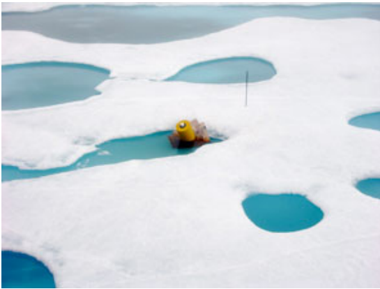
We found it! This is ITP-4 in its melt pond.