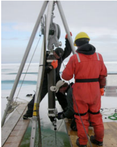
ITP-4 was recovered the following day. All the data that were not sent via satellite appear to be stored in the profiler.