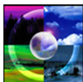
North American Carbon Program