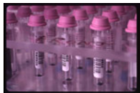
Photo of graphite samples, or pure carbon and Fe catalyst ready for pressing into an AMS target.

Please aim for a sealed pressure of less than 2 atmospheres and a flame-sealed tube length of 6-7 inches. Label the with attached tape or paper (tightly attached) or use a permanent black marker to label the ampoule. Process used: Gas Sample .