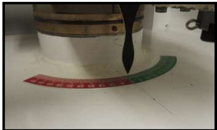
Rudder Angle and Heading Indicator (electronic and mechanical)