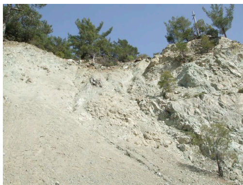
Photo 1. Outcrop of the Amiandos Fault on the Troodos-Kakopetria road. Serpentinized ultramafics (left) are juxtaposed against gabbros (right). This fault has been recently interpreted as a detachment fault associated with an oceanic core complex [Nuriel et al., 2009].

(d) To see one of the calcium-rich, alkaline (Lost City/Blue Pool type) springs indicative of active serpentinization