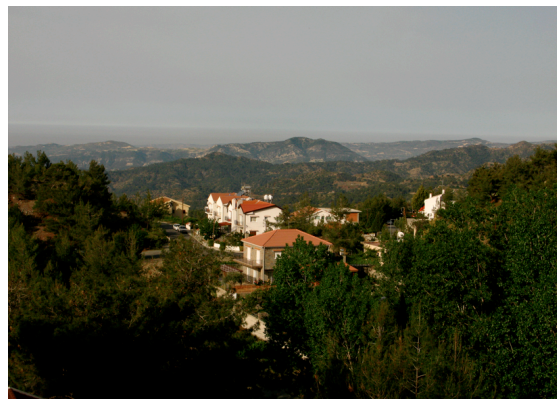
Agros village, Cyprus (view from the Conference venue)