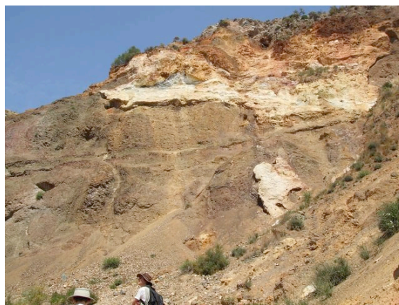
Photo 4. Mavridhia open-cast mine. The sulfide deposit (light yellow and orange colors) is sandwiched between unaltered (top) and hydrothermally altered (brown color, bottom half) lavas.

(d) To investigate the open cast pit of the Mavridhia copper deposit, itself also tilted steeply (e.g., Photo 4).