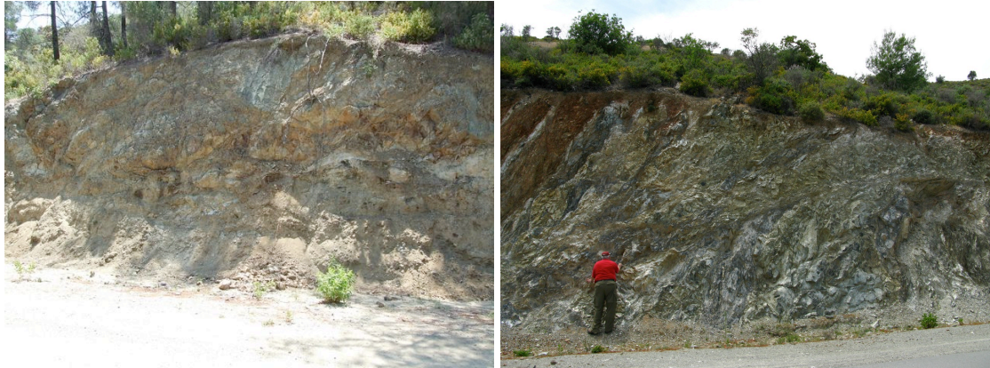
Photo 5. Outcrop of a detachment fault separating highly altered dikes (top) from serpentinitized harzburgite (bottom).