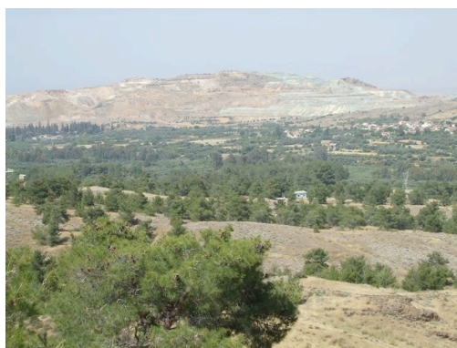
Photo 3. View of the Solea graben from the Flasianna viewpoint. In the background is the Skouriotissa open-cast copper mine, a massive sulfide deposit of size and chemical composition similar to those of the active TAG hydrothermal sulfide deposit at the MAR [Humphris and Cann, 2000], located on the hanging wall of an oceanic detachment fault [Tivey et al., 2003].