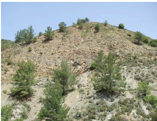
Photo 2. View of the Kakopetria detachment separating highly rotated, sub-horizontal dikes (top) from sheared gabbros (bottom) [Varga, 1991].