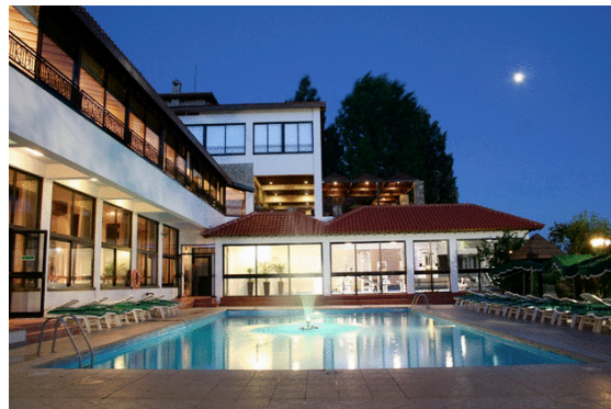
Views of the Chapman Conference venue, Rodon Hotel