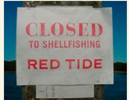
Bill Walton, Sea Grant/CCCE

With the 2005 outbreak of red tide, Woods Hole Sea Grant rushed to provide information about red tide to concerned fishermen, seafood consumers, visitors and government officials.