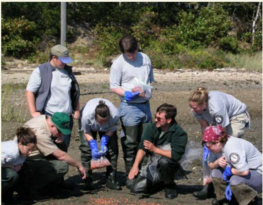
In the area of Fisheries and Aquaculture, staff members work with a diverse group of individuals, unified by their interest in shellfish. In addition, the program has a strong field research component.