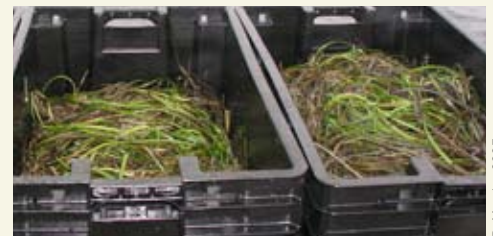
D. Murphy, CCCE

Efforts to restore eelgrass are not new, but none have achieved unqualified success. To date, restoration efforts have required large investments of labor (often volunteered), exhibited poor success, or both. Despite these problems, the importance of eelgrass—as well as bay scallops—prompted Woods Hole Sea Grant to explore potential restoration options.