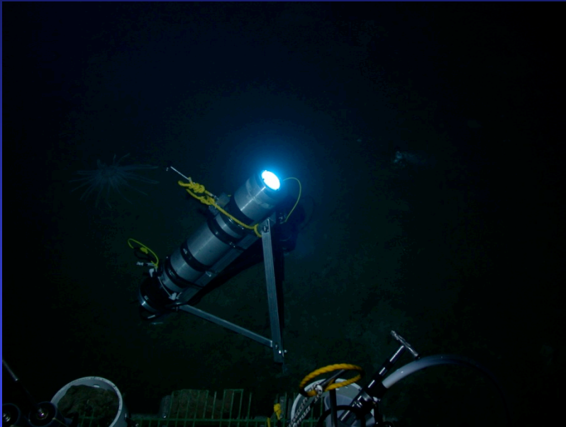
High power hemispherical transmitter