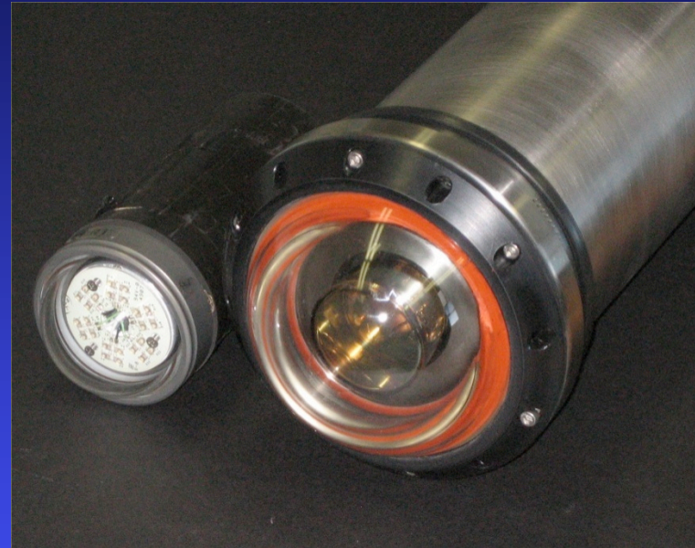
Sensitive hemispherical receiver