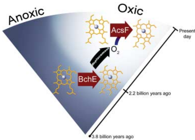
Fig. 2 On the early anoxic Earth (blue), oxygen-independent BchE was required for photosynthetic pigment synthesis and is still used in modern anaerobic phototrophs. Phototrophs living in oxic environments (white) have replaced BchE with an enzyme that catalyses the same steps but utilizes molecular oxygen. This represents just one of many remarkable examples of the independent evolution of enzymes that postdate the oxidation of Earth's atmosphere.

This BchE/AcsF replacement, conceptualized against an evolving biosphere in Fig. 2, is not the only anaerobic-to-aerobic switch that has occurred in the biosynthesis of diverse tetrapyrroles (of which chlorophyll, vitamin B12, and heme are all examples). Further examples include two successive oxidative steps en route to synthesizing heme with O 2 -dependent and