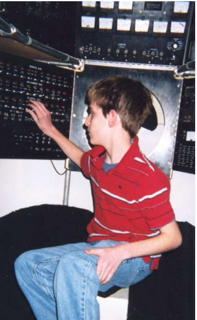
A Perkins student checks out a model of the Alvin at the Woods Hole Exhibit Center.

Despite coping with seasickness and 6 m seas, I did