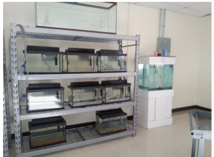
New aquaponics lab installed at Bourne High School.