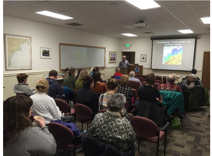
WHSTEP Winter 2016 Meeting.

number as to how many individual whales of different species have been harvested over time. Mr. Rocha also shared some activities that teachers can use in explaining food webs and whale acoustics to students.