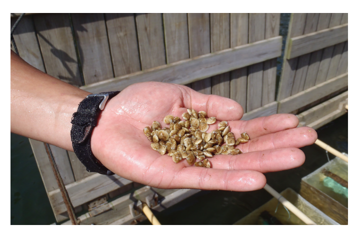
Figure 2. Quahog seed being grown through a municipal shellfish program.

Since bivalve shellfish obtain nutrition from their local environment and are an integral part of the ecosystems in which they live, managing shellfish populations has become an important part of managing a healthy water body. Unfortunately, due to a number of factors most of our nearshore shellfish populations are in decline. In fact, it has been estimated that 85% of oyster reefs have been lost globally, with U.S. Atlantic coast oyster reefs classified as poor or functionally extinct (Beck et al. 2011). With declines in natural populations and increased recognition of ecosystem services lost, communities are increasingly interested in examining the potential for propagation and/ or restoration of shellfish to help remediate a portion of increasing nutrient inputs.