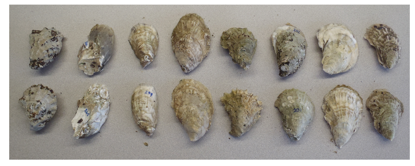
Figure 4. Varying morphology of oysters from different sources.

Local nitrogen content data indicate Massachusetts shellfish are indeed an important part of nutrient cycling in nearshore waters, and the harvest of their tissues may represent a method to directly remove nitrogen from enriched embayments. In addition to the habitat value of shellfish and the removal of nitrogen through harvest, there is potential for additional nitrogen removal through the processes of denitrification and burial though these numbers are more difficult to quantify. Quantification of nitrogen removal through shellfish harvest can be accomplished more simply and directly than quantification of denitrification. However nitrogen removal through harvest will potentially fluctuate as a result of seasonal variations in shellfish activity, a population's susceptibility to predation and disease, or extreme weather events. This method also requires