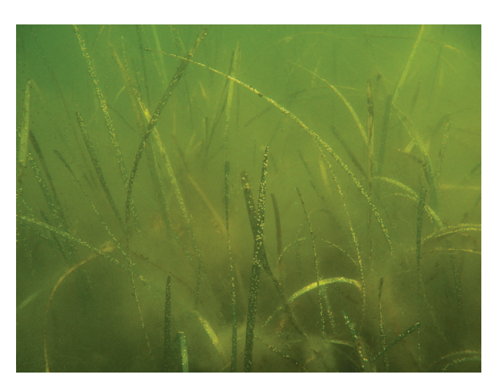
Figure 1. Eelgrass competing with macroalgae or seaweed in nutrient rich waters. Eutrophication will often cause eelgrass to decline as algae takes over, one way in which marine habitat may be altered.

Our coastal water bodies and estuaries are essential habitat for many species and are also important to the economic health of coastal communities. While nitrogen (N) is a vital nutrient to the marine environment, in excess it causes eutrophication or an increase in the rate of supply of organic matter to a system (Nixon 1995). Eutrophication can lead to a series of negative consequences and thus nitrogen can be a root cause of habitat degradation (Howarth 2008). Reducing nitrogen to thresholds identified as important to maintain ecosystem health is the approach being examined throughout coastal Massachusetts. Strategies being considered for reduction of nitrogen include centralized or improved wastewater treatment, stormwater treatment, increased tidal flushing, enhanced attenuation via wetlands, and others (Dudley 2003).