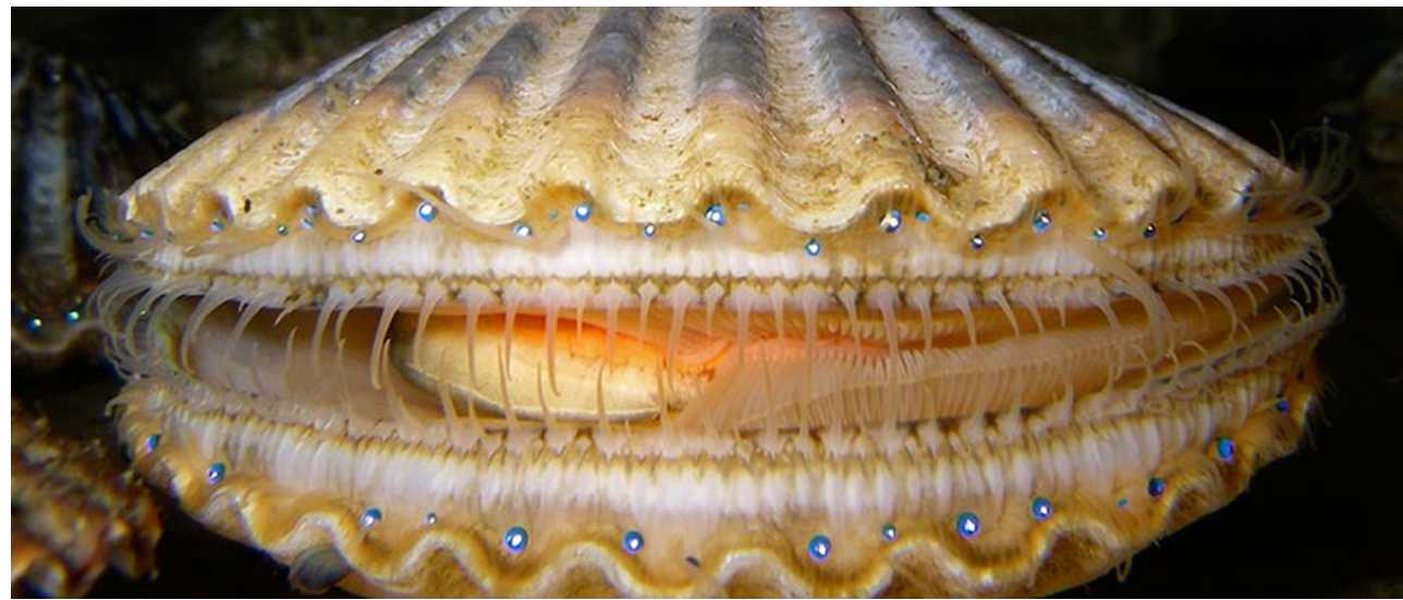
Here's looking at you. Silvery eyes line the edges of scallops' shells, helping them sense light and movement.

HOW WILL SHELLFISH FARE AS OCEAN CONDITIONS SHIFT? by Elizabeth Halliday