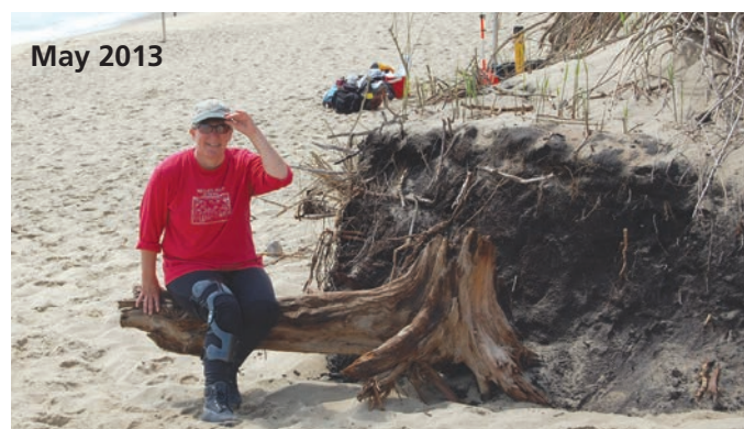
The exposed features are typically short-lived on our shoreline. The natural processes that govern the beach have replenished over 5' of sand from March to May (as shown in the pictures above) at Coast Guard Beach in Eastham.