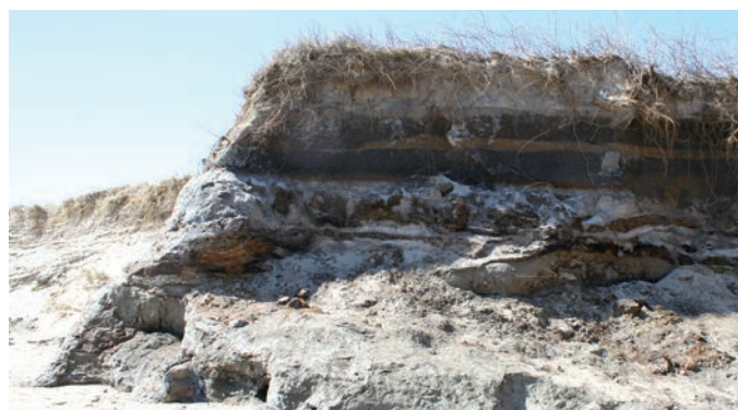
An example of a recently exposed outcrops. The color and sediment type (sand/mud/clay) changes indicate different depositional environments.

The stratigraphic record (aka the layer cake of different types of soil, that you would encounter by digging a hole, with each layer correlating to a distinct ancient environment) of Cape Cod changes dramatically depending on the exact area in which you are looking at it. In general, there are layers of till and outwash deposits characterized by a mix of sand, gravel, and large boulders, and/or glacial lacustrine clay (ancient lake deposits) form the basement of many coastal landforms on Cape Cod. These earlier deposits have been reworked by waves and wind and often capped by salt marsh peats and sandy beach/dune material. During the regression when sea levels were about 400 feet (130 meters) below present levels, forest soils and freshwater marshes, were deposited over the ancient lake clays. As sea level began to rise, large areas of Cape Cod's ancient landscapes were removed from the geologic record by erosion and reworking of sediment. The record left by a migrating beach illustrates the transition between fresh and saltwater systems. In this case, areas once containing coastal forests transitioned to salt marsh or beach environments. Evidence of these former landscapes can be seen in the recently exposed outcrops on Cape Cod beaches.