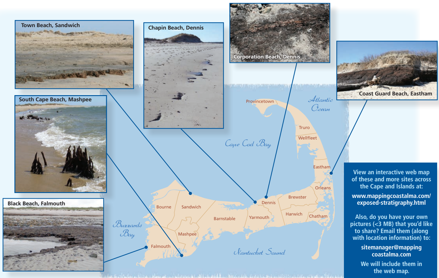
Figure 1. Locations of some of the preserved ancient landscapes that are now exposed on Cape Cod.

Cape Cod is subject to erosion when wind, waves, and currents erode the sand along the shoreline. Coastal storms (e.g., Hurricane Sandy in October 2012, followed by several large, slow moving extra-tropical storms locally referred to as nor'easters) dramatically intensified erosion in many areas on Cape Cod, lowering beach