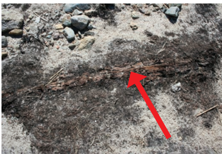
A log located within a peat deposit.

Peat is a soft organic material consisting of partly decayed plant matter that accumulated in a water-saturated environment and in the absence of oxygen. Peat can take hundreds to thousands of years to form and is quite fragile. It can be quickly eroded by waves or human activities. In order to preserve this coastal resource some towns on Cape Cod have prohibited the removal of peat for the purposes of harvesting shellfish (information usually available in shellfish regulations on your town website). The peat on Cape Cod is derived from both fresh and saltwater marshes and can often contain preserved remnants of past terrestrial environments including stumps secured in growth position (explained in more detail on next page). Peat deposits can provide a wealth of information about past environments, including whether it was fresh, or salt water and at what elevation they were formed.