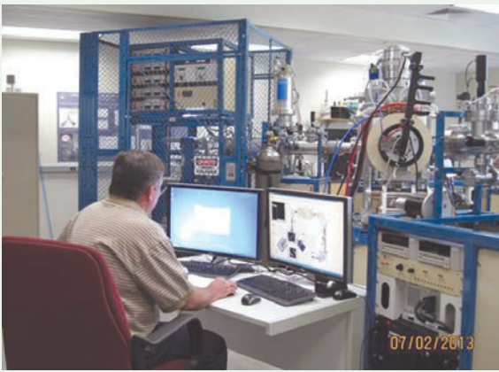
One of NOSAMS' two accelerator mass spectrometers. In these instruments, the atoms of ^{14}\text{C} in a sample are counted and compared to those in a standard. This information can be used to determine the age of samples younger than about 50,000 years.