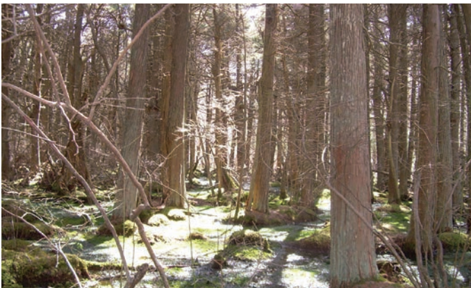
Example of a modern day Red Cedar forest located near a coastal system.

A series of nor'easters in the spring of 2010 swept the New England coastline resulting in significant erosion along South Cape Beach, a barrier system located in Mashpee. The erosion revealed 111 stumps and a preserved peat outcrop. It is likely that the stumps represent an ancient Eastern Red Cedar, ( Juniperus virginiana ), stand growing in a back-barrier environment, and drowned by episodic storm events, and moderate rates of sea-level rise. The site has provided ample research and education opportunities.