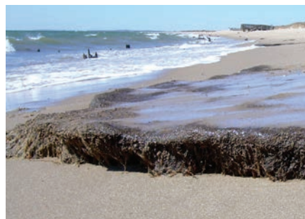
A layer of peat exposed in the intertidal zone of the beach.