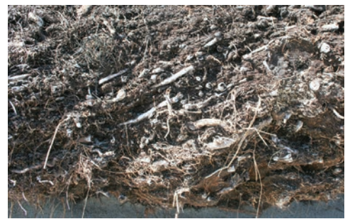
A close-up of a peat deposit showing the roots, sticks, and twigs that are intertwined throughout the peat matrix.