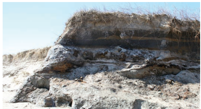
An example of a recently exposed outcrops. The color and sediment type (sand/mud/clay) changes indicate different depositional environments.

The stratigraphic record (aka the layer cake of different types of soil, that you would encounter by digging a hole, with each layer correlating to a distinct ancient environment) of Cape Cod changes dramatically depending on the exact area in which you are looking at it. In general, there are layers of till and outwash deposits characterized by a mix of sand, gravel, and large boulders, and/or glacial lacustrine clay (ancient lake deposits) form the basement of many coastal landforms on Cape Cod. These earlier deposits have been reworked by waves and wind and often capped by salt marsh peats and sandy beach/dune material. During the regression when sea levels were about 400 feet (130 meters) below present levels, forest soils and freshwater marshes, were deposited over the ancient lake clays. As sea level began to rise, large areas of Cape Cod's ancient landscapes were removed from the geologic record by erosion and reworking of sediment. The record left by a migrating beach illustrates the transition between fresh and saltwater systems. In this case, areas once containing coastal forests transitioned to salt marsh or beach environments. Evidence of these former landscapes can be seen in the recently exposed outcrops on Cape Cod beaches.