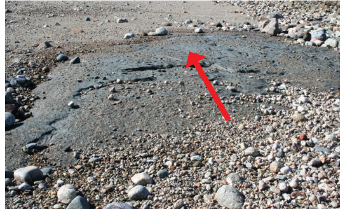
An example of clay exposed at the surface of a beach.