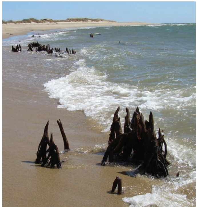
Erosion along a 200-meter section of South Cape Beach State Park (Mashpee) revealed the presence of 111 preserved stumps in growth position in intertidal and subtidal areas within an intermittent peat deposit.