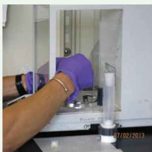
Samples, such as wood or peat, are weighed into individual reactors (above) for pretreatment in an automated reaction system (left). Pretreatment removes extraneous carbon, such as carbonate and soluble humic material, and ensures that the carbon being dated is from the selected macrofossil.

carbonate and soluble humic material, and ensures that the carbon being dated is from the selected macrofossil.