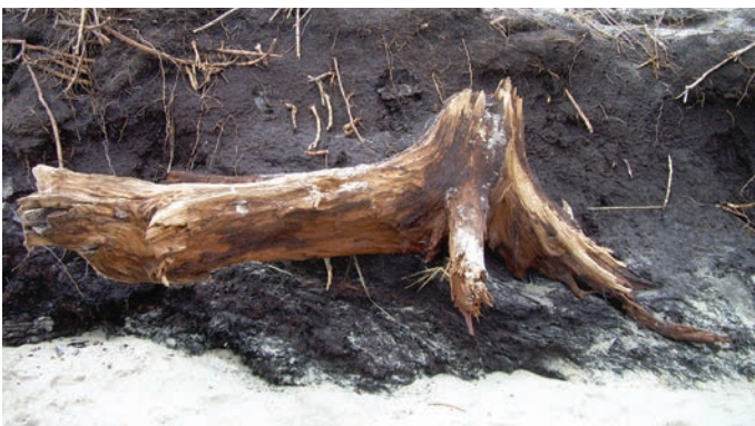
A stump sticking out of a layer of peat at Coast Guard Beach in Eastham. Based on two samples from within the vicinity of the stump it is likely more than 8,000 years old.