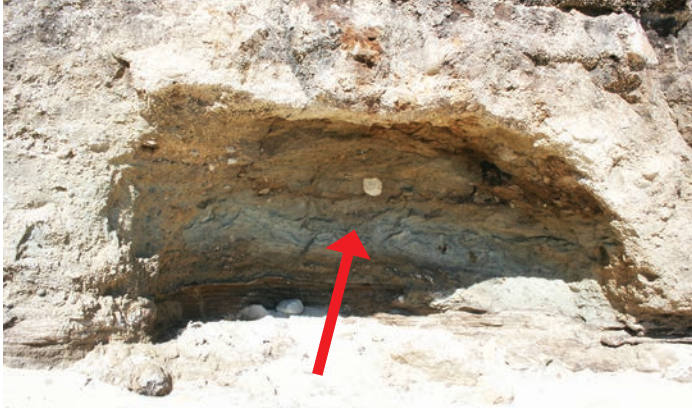
An example of clay exposed, as one of the layers comprising the coastal bank.

Clay that was deposited by glacial activity, often within large lakes formed by meltwater, can often be found under the peat. These stratigraphic layers are periodically exposed during storms and then are reburied as the beach and dune systems are reshaped by wind and waves. In southeastern Massachusetts, the materials deposited at the terminal end of the glacier, impounded large bodies of fresh water during the initial glacial melting period. This turned the landscape of what is now Cape Cod Bay into a glacial lake; the blue clay relates to deposits formed in this fresh water environment.