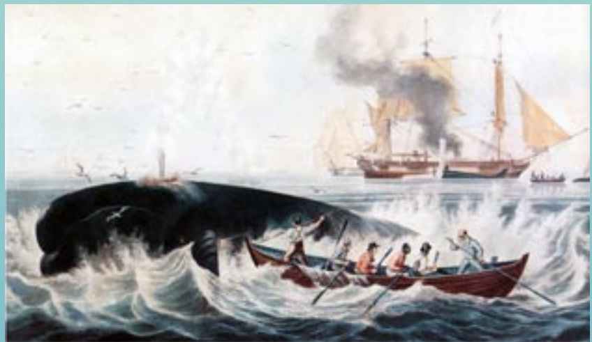
"The Hunt" (American School)

But to know how to help this dwindling population, we need to know much more about the factors preventing its recovery. We need to learn much more about the lives of whales, whose vast watery domain has made them far more difficult and inaccessible to study than terrestrial animals.