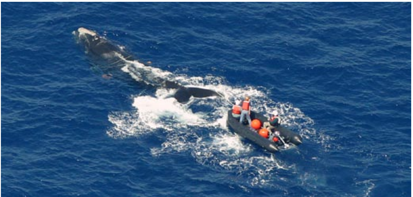
LIBERATING LEVIATHANS—A rescue team from the Center for Coastal Studies attempts to free a right whale with fishing lines wrapped around it. Fishing gear entanglements kill a significant number of North Atlantic right whales.