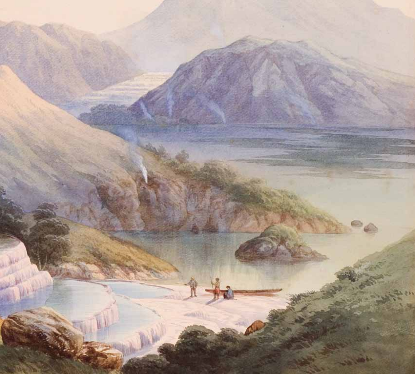
The Pink Terraces were tucked next to a hook-shaped spit of land, with the White Terraces in the background and Mount Tarawera looming behind.

from differences in mineral composition or microbial populations in their waters.