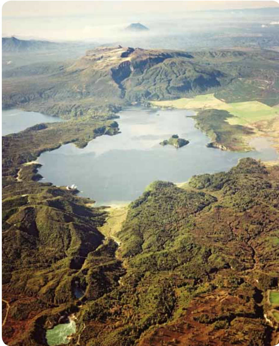
In the 1886 eruption of Mount Tarawera (the flat-topped mountain at far end of lake), a rift more than 10 miles long tore through the floor of Lake Rotomahana and beyond.

Lake Rotomahana is still very isolated; to get there each day from their motel, the researchers drove 15 minutes on a highway, then 15 minutes on a paved road through pastureland, then nearly 20 minutes on a four-wheel-drive road, finally reaching a put-in point just large enough for one vehicle to back the boat it was towing into the water.