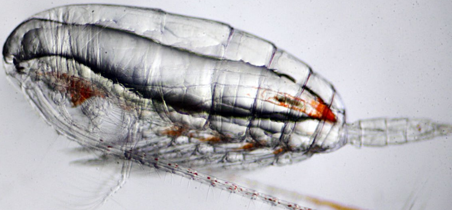
Ann Tarrant, WHOI

I found that the open-ocean Vibrio ordalii elicited virtually no transcriptomic response in my copepod species. But when I exposed copepods to Vibrio sp. F10 , which do colonize copepods, the copepods showed no signs of being sick, and we found a