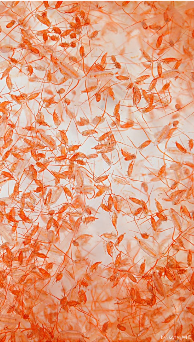
Ken Kostel, WHOI

Copepods are small marine crustaceans that eat phytoplankton and are an important link in the ocean food chain. Below, a close-up view of a copepod.