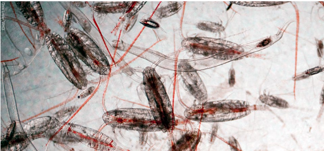
Chris Linder - WHOI

Copepods, next to a pencil tip on the opposite page and in a sample from the Bering Sea below, are tiny shrimplike creatures. They are ubiquitous and provide a major source of food in the ocean. They may also act as hosts for bacteria, including pathogenic ones.